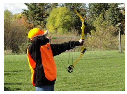
Outdoor skills education