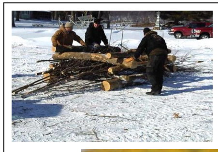
Building fish cribs